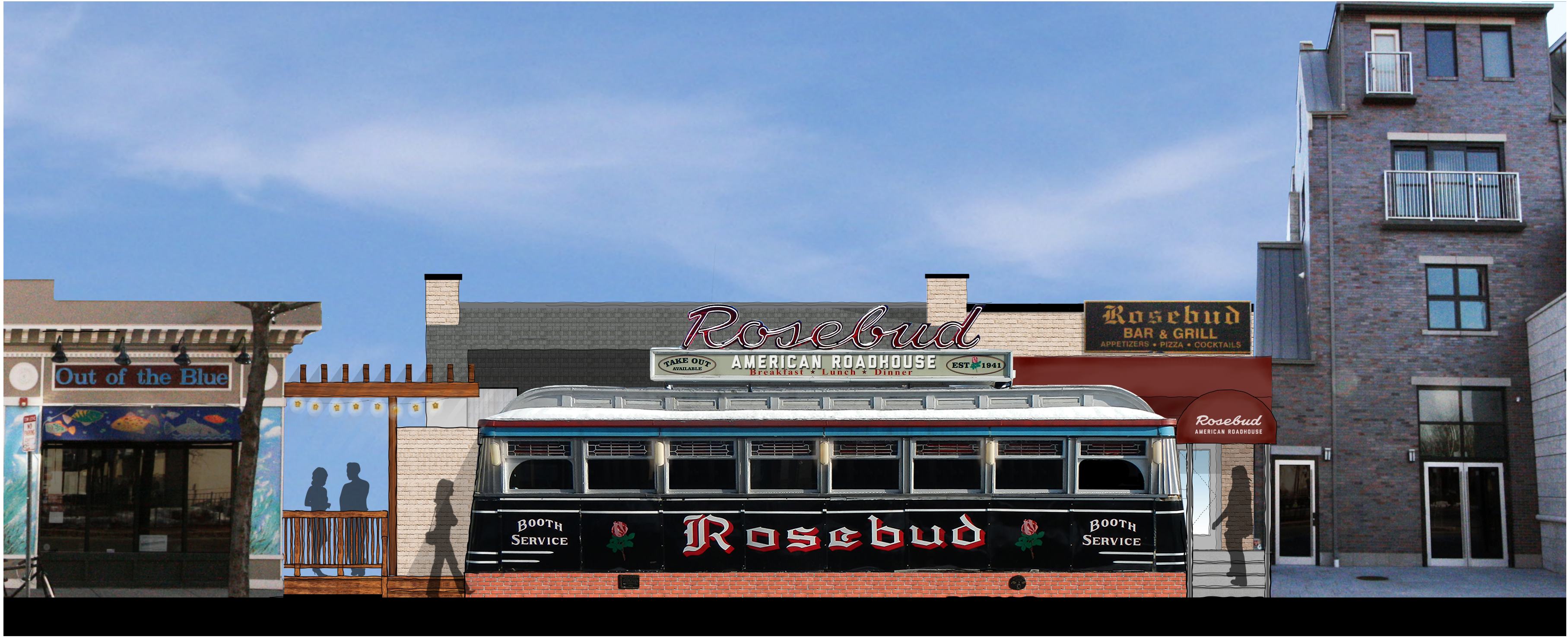
2 Rendered Exterior Elevation Scale: 1/4" = 1'-0"