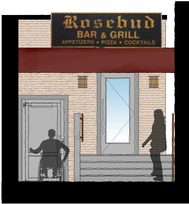
3 Rendered Entry Elevation Scale: 1/4" = 1'-0"